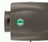
HCWB3-12 Bypass Humidifier 12 gallons per day